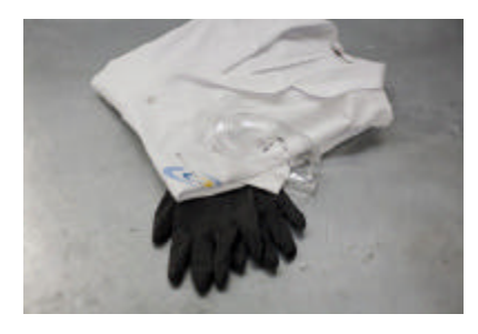
Wear work clothes, gloves and goggles.