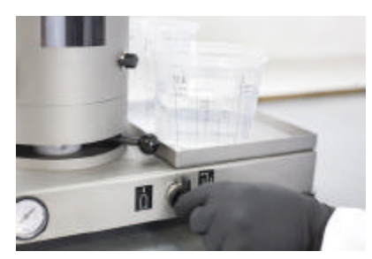
Step 5: Turn the switch to suction". The solvent will be sucked.