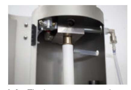
Info: The bar must set exactly on the filler neck.