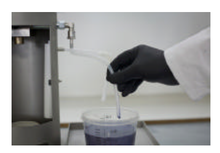
Step 2: Put the container with varnish on the bin and insert the suction hose.