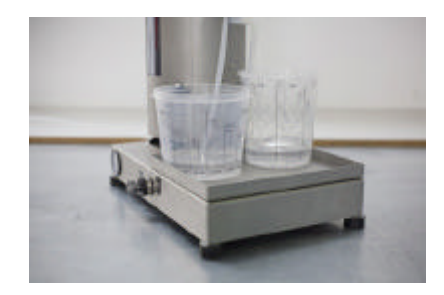
Info: Were water based varnishes filled, for rust protection you should finally rinse with solvent several times.