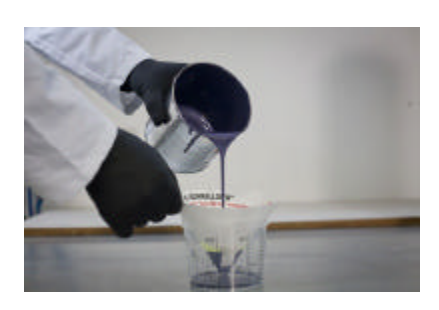
Step 1: Filtrate the colour before filling.