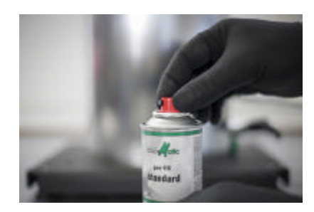
Step 3: Take off the nozzle.