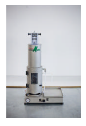
Filling process VitoMat III