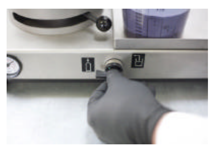
Step 9: With the switch on the front you can choose either the position "suction" (on the right) or "filling" (on the left).